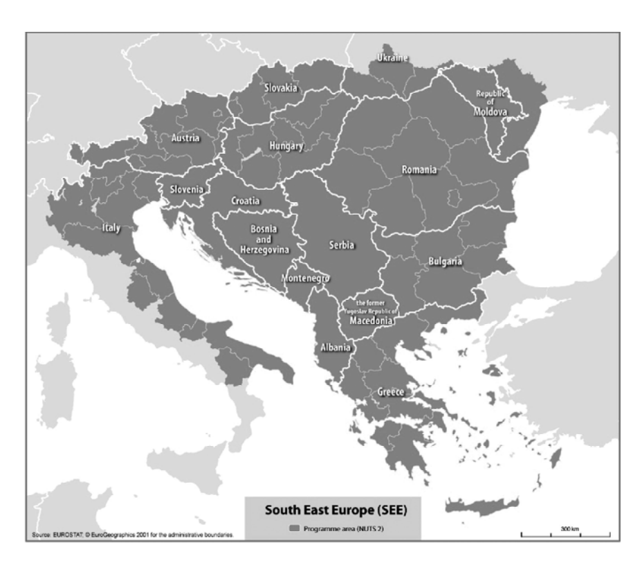
Figure 1. South East Europe (SEE) Programme area

For territorial cooperation and cohesion. factors related to topography and territorial structures are very important. Topography determines territorial cohesion accessibility, and therefore the cross-border infrastructure. The establishment of new countries and of new frontiers has upset preexisting relations, created new spatial entities, prolonged external borders and put up new obstacles for economic and territorial integration. Since 1990, the area has undergone fundamental political, social and economic changes. Through successive enlargements of the EU, Austria, Slovenia, Slovakia, Hungary, Romania and Bulgaria have become part of unified Europe. The dissolution of Yugoslavia was accompanied by the creation of new independent states. These changes altered the physiognomy of the programme area and made the border situation more complex. The management of the new border complexity is an important aim of the territorial cooperation policy (Vujošević, 2007).